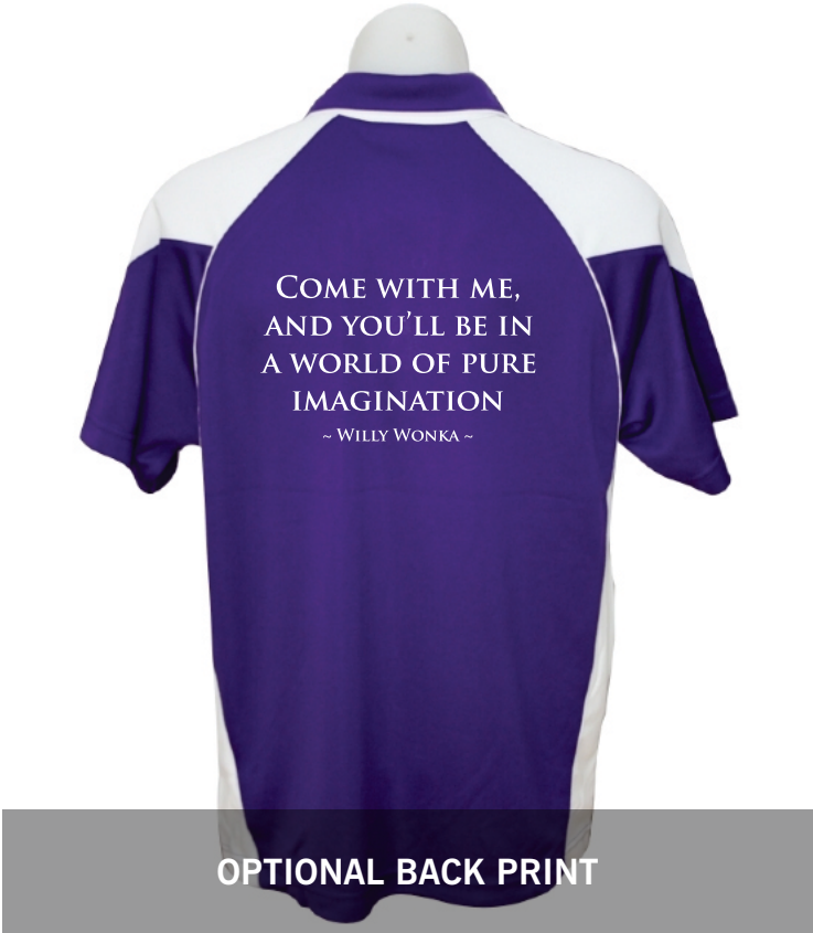
OPTIONAL BACK PRINT