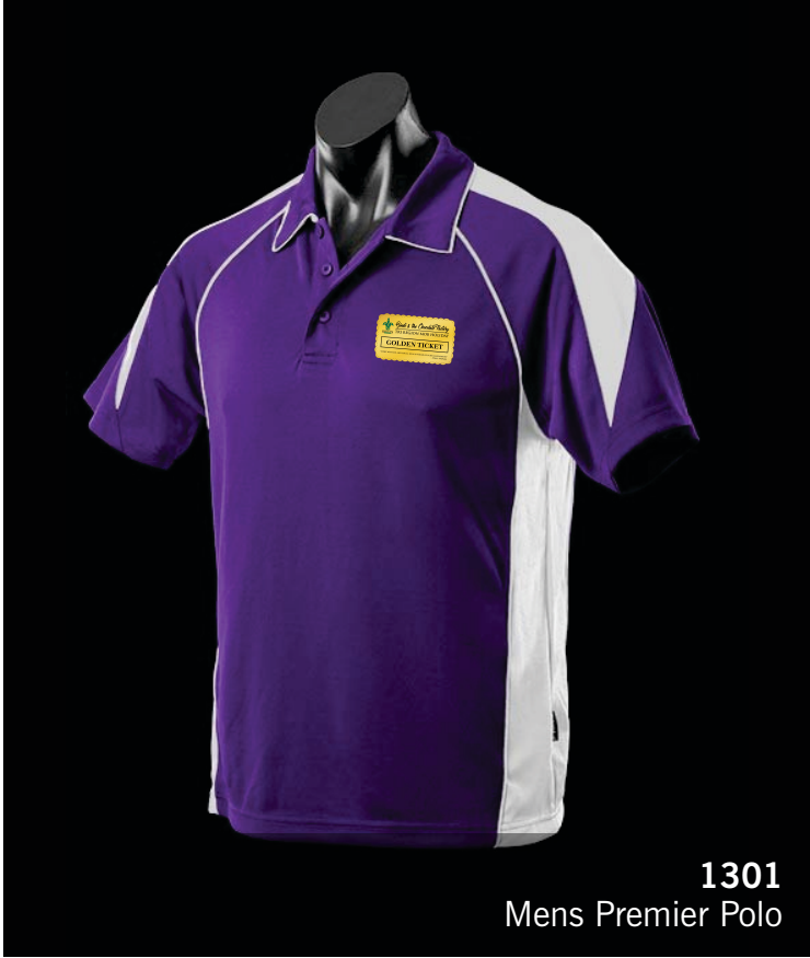
1301 Mens Premier Polo